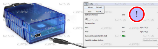
Figure 2: Before using the dongle